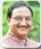
RAMESH POKHRIYAL "NISHANK"

Language gives a true introduction to society and culture. Having a rich language is considered a major contribution to a civilized society. Today there is a need for a language of universal welfare that teaches us to communicate with our loved ones, identify ourselves and which